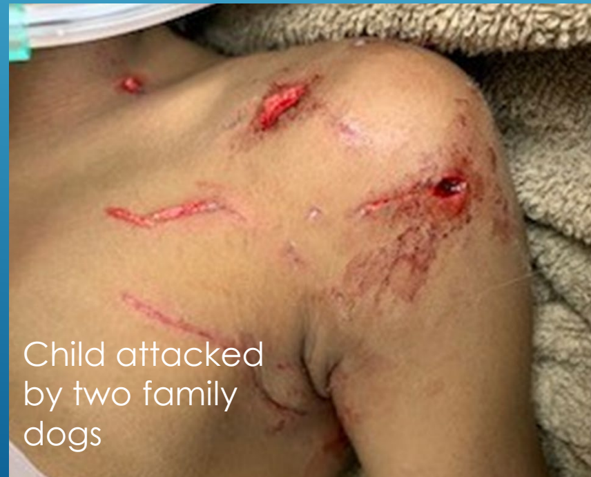
Child attacked by two family dogs