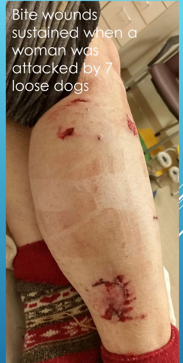
Bite wounds sustained when a woman was attacked by 7 loose dogs