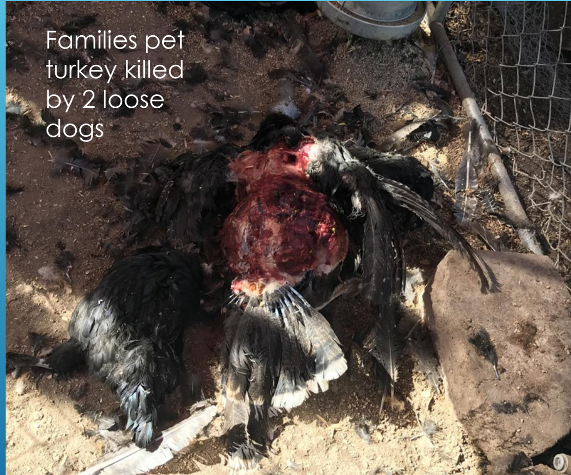
Families pet turkey killed by 2 loose dogs