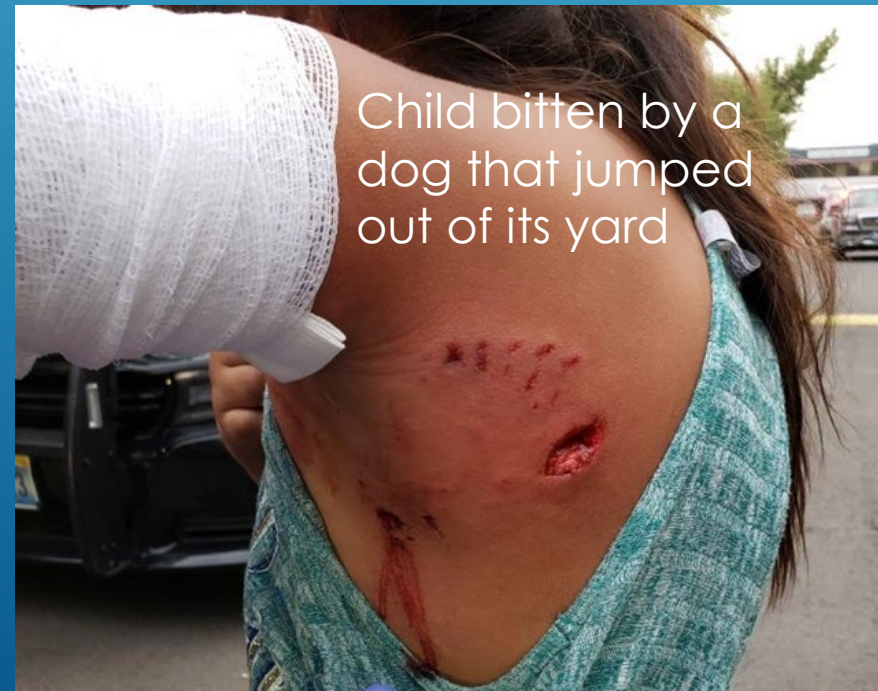
Child bitten by a dog that jumped out of its yard