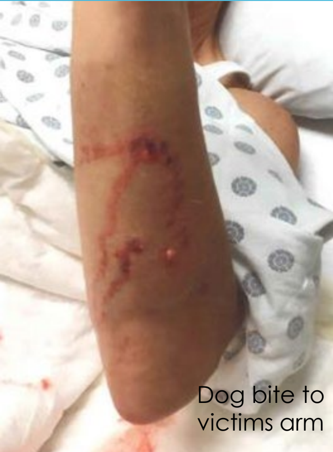
Dog bite to victims arm