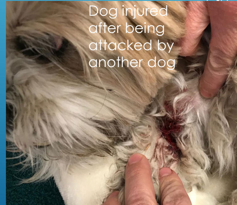
Dog injured after being attacked by another dog