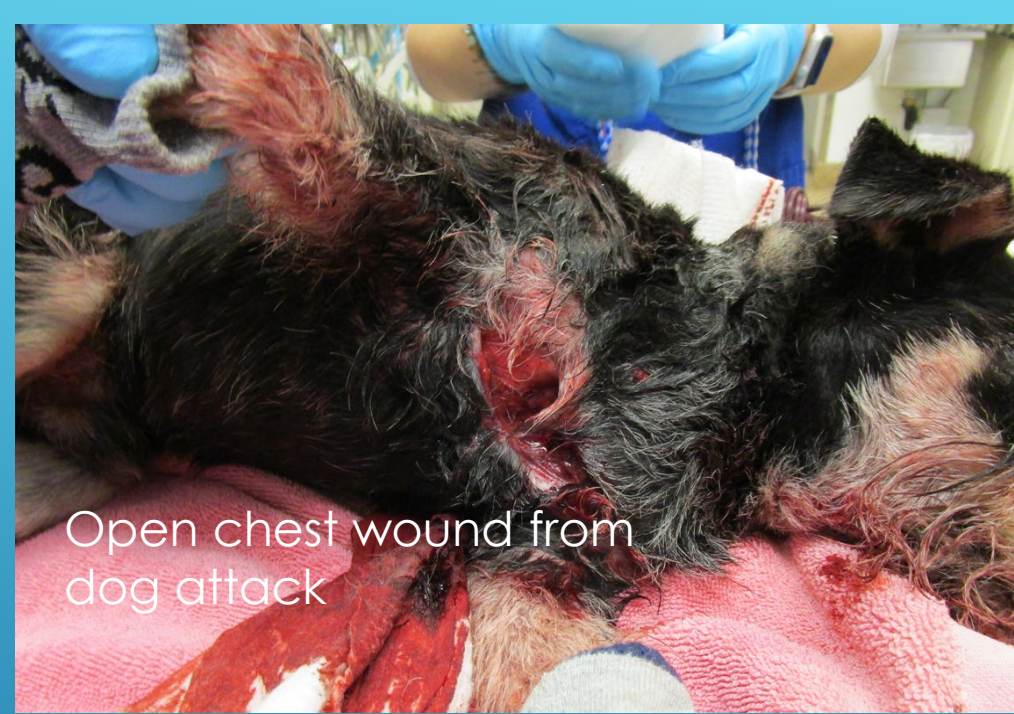
Open chest wound from dog attack