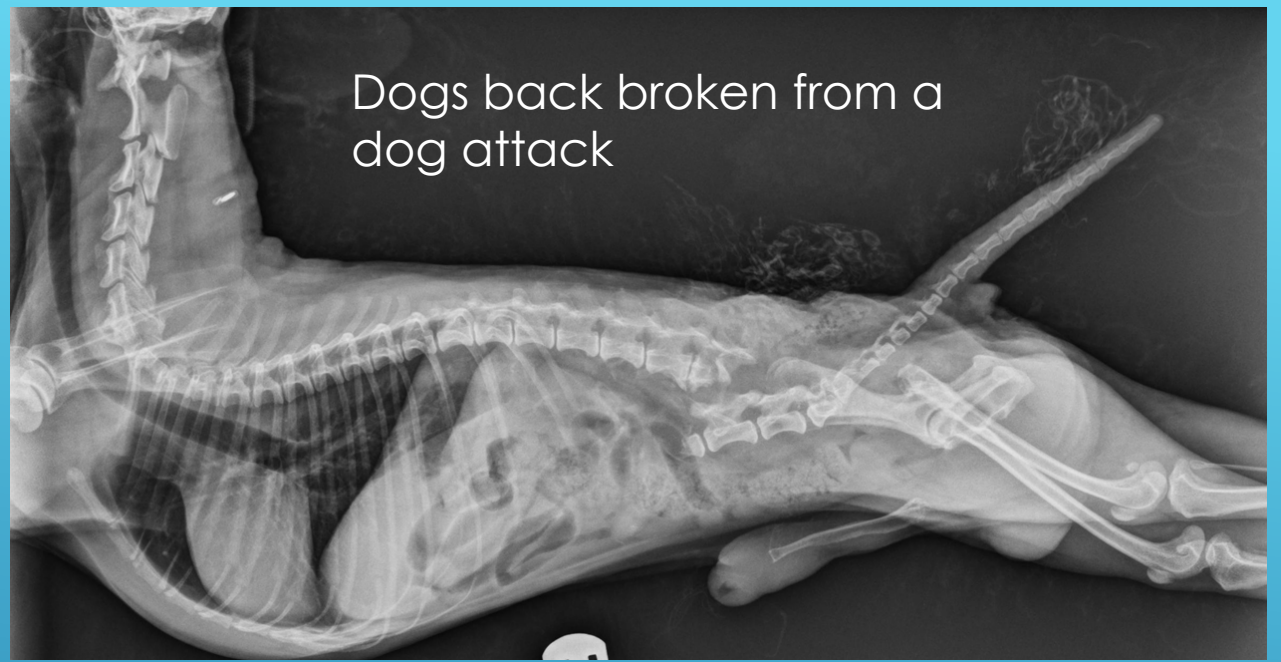
Dogs back broken from a dog attack